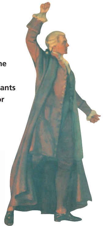
James Otis, Jr., argues in court against illegal search warrants in 1761.

During the French and Indian War, Britain and the colonies fought side by side. Americans took great pride in being partners in the victory over the French. However, when the war ended, problems arose. Britain wanted to govern its 13 original colonies and the territories gained in the war in a uniform way. So the British Parliament in London imposed new laws and restrictions. Previously, the colonies had been allowed to develop largely on their own. Now they felt that their freedom was being limited.