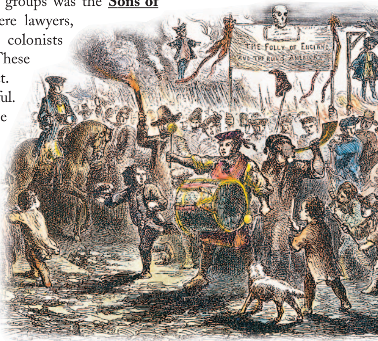
Colonists protest the Stamp Act.

The protests in the colonies had an effect in Britain. Merchants thought that their trade with America would be hurt. Some British political leaders, including