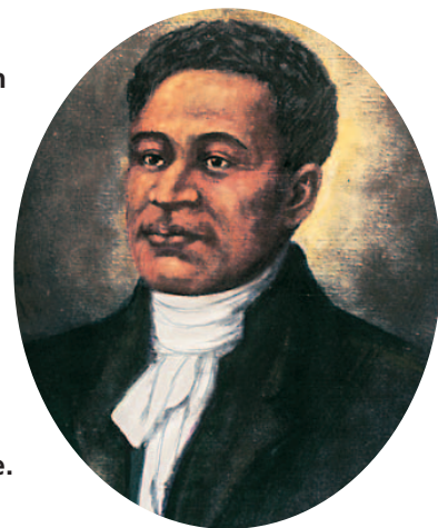
Crispus Attucks, a sailor of African-American and Native American ancestry, was an early hero of America's struggle for freedom.

In March 1770, Attucks found himself in Boston, where feelings against British rule were hot. One night Attucks took part in a disturbance between colonists and British troops. He was about to play a key role in U.S. history—losing his life to a British bullet in a protest that came to be called the Boston Massacre. In Section 2, you will read how tension between Britain and its colonies led to violence.