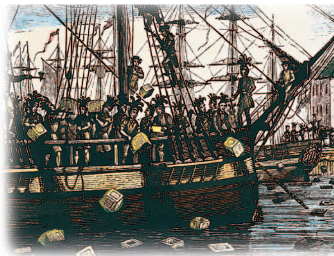
Colonists dumped hundreds of chests of tea into Boston Harbor in 1773 to protest the Tea Act.

Protests against the Tea Act took place all over the colonies. In Charleston, South Carolina, colonists unloaded tea and let it rot on the docks. In New York City and Philadelphia, colonists blocked tea ships from landing. In Boston, the Sons of Liberty organized what came to be known as the Boston Tea Party .