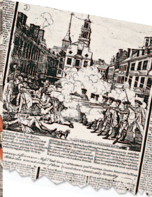
This engraving, The Bloody Massacre Perpetrated in King Street by Boston silversmith Paul Revere, appeared in the Boston Gazette .

“no mobs. . . . Constitutional methods are best.” However, tempers were running high. When customs officers in Boston tried to seize the American merchant ship Liberty , which was carrying smuggled wine, a riot broke out. The rioters forced the customs officers to flee.