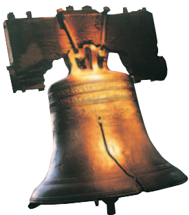
The Liberty Bell was rung to announce the first public reading of the Declaration of Independence, in Philadelphia on July 8, 1776.

Two days later, on July 4, 1776, Congress adopted the document that proclaimed independence—the Declaration of Independence. John Hancock, the president of the Congress, was the first to sign the Declaration. According to tradition, he wrote in large letters and commented, “There, I guess King George will be able to read that.” The core idea of the Declaration is based on the philosophy of John Locke. This idea is that people have unalienable rights, or rights that government