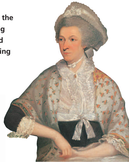
Abigail Adams was an early advocate of women's rights and one of the great letter writers in history.