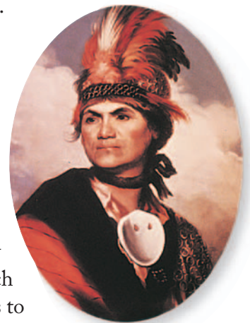
The Iroquois chief Joseph Brant was a British ally.