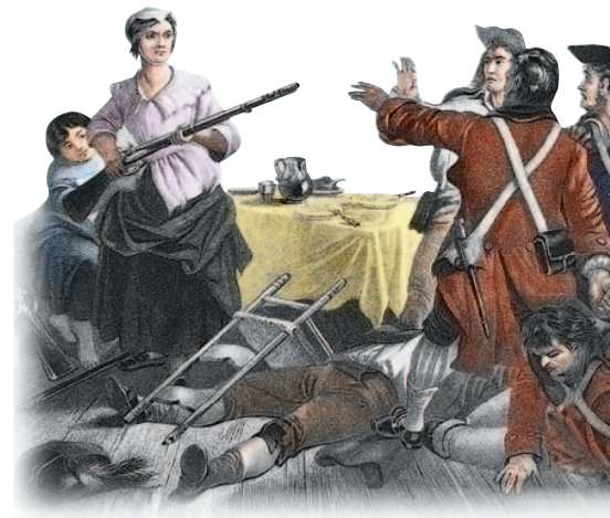
The state of Georgia named a county after Nancy Hart, who is shown here holding Loyalists prisoner.

As Nancy Hart's story demonstrates, the fighting between Patriots and Loyalists in the South was vicious. In this section, you will learn why the British war effort shifted to the South and why it failed.