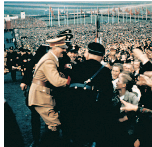
Adolf Hitler in a Harvest Festival crowd, 1937