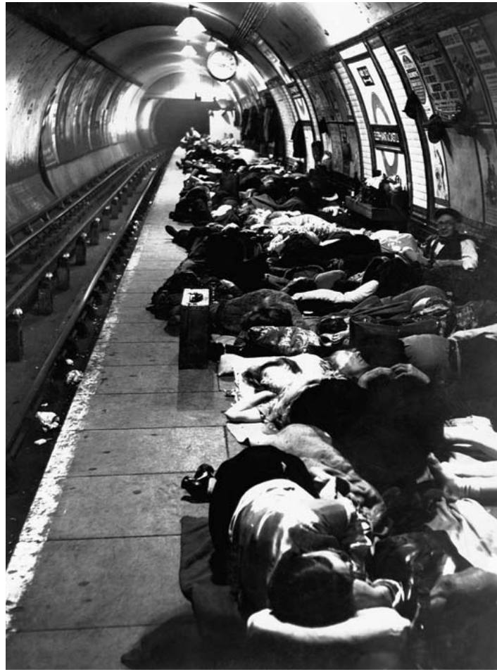
British civilians sleep in a subway station being used as an air raid shelter during the Battle of Britain in 1940.

German planes also unleashed massive bombing attacks on London and other civilian targets. By September, however, the Battle of Britain had left Hitler frustrated. The RAF was holding off the Luftwaffe. And despite constant bombing, the British people did not surrender.